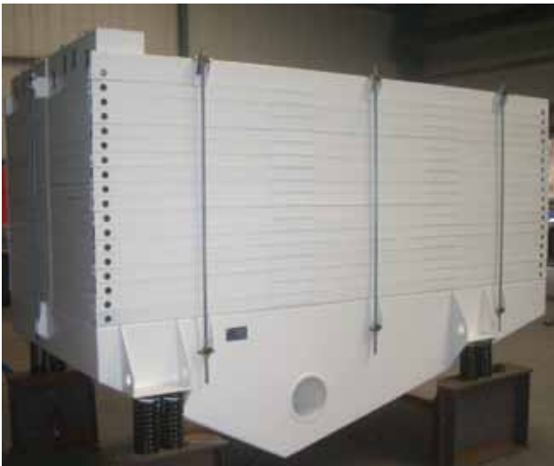
Production machine MHR 20/28/XVII (2 IIX) width 2000 mm, length 2800 mm with 17 decks in two screen units